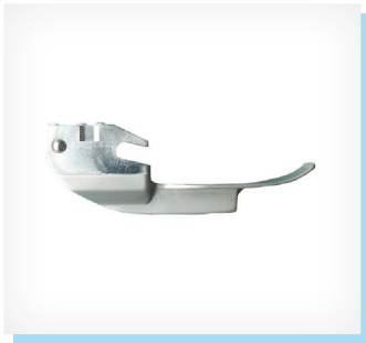
Optional blade sizes available are: Miller 0