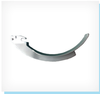
and Mac 5.